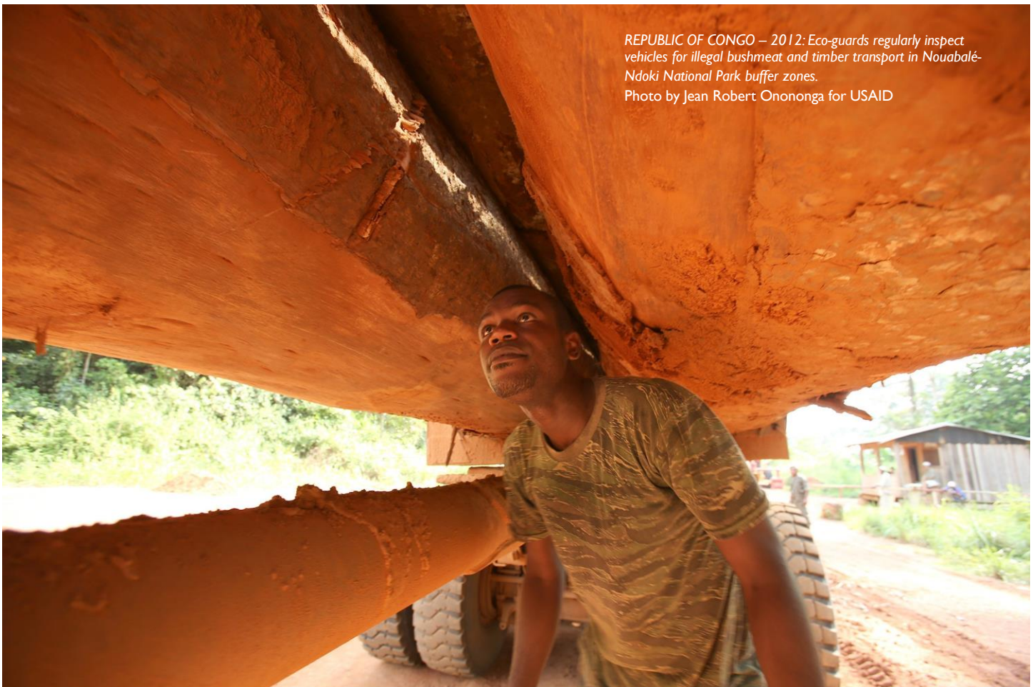
REPUBLIC OF CONGO – 2012: Eco-guards regularly inspect vehicles for illegal bushmeat and timber transport in Nouabalé-Ndoki National Park buffer zones.