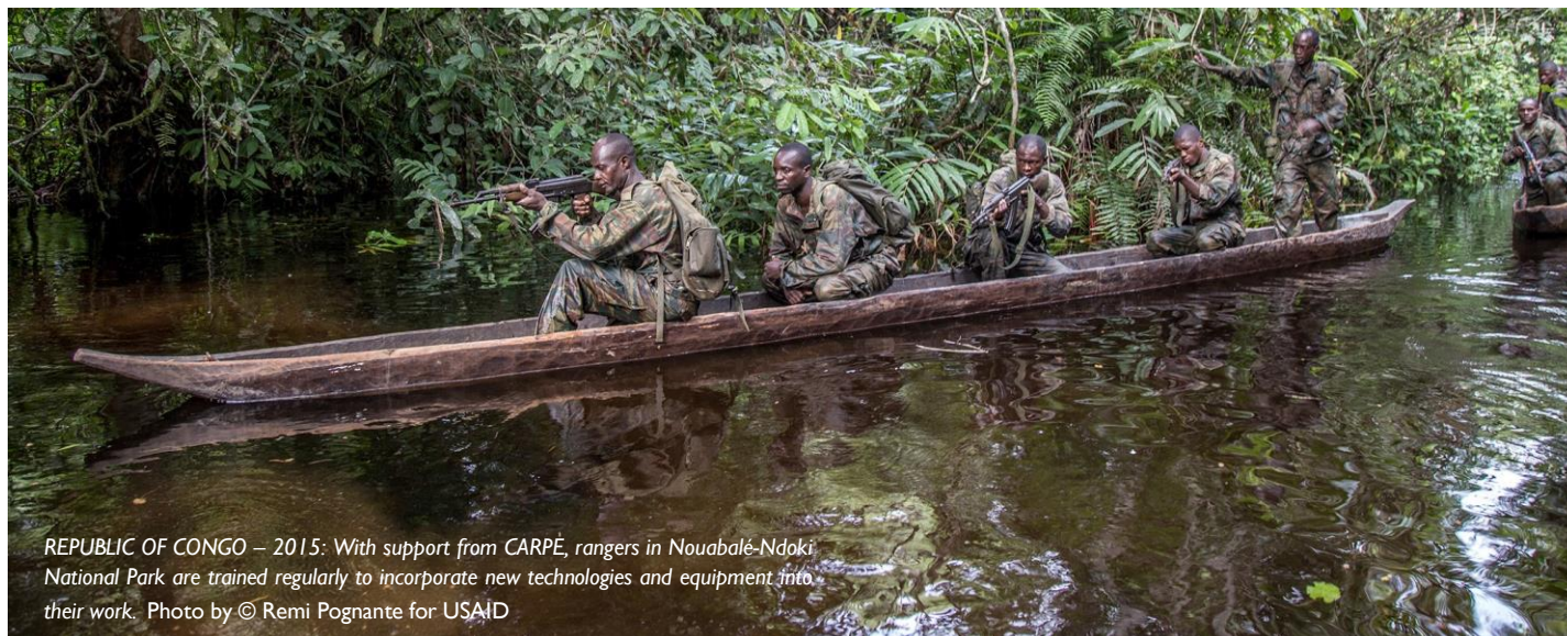
REPUBLIC OF CONGO – 2015: With support from CARPE, rangers in Nouabalé-Ndoki National Park are trained regularly to incorporate new technologies and equipment into their work.

government is working to implement improved management plans. The project is providing eco-guards to patrol the concessions, conducting roadblocks to check vehicles for forest bushmeat and monitoring the collection and sale of bushmeat by distributors in both rural communities and surrounding towns.