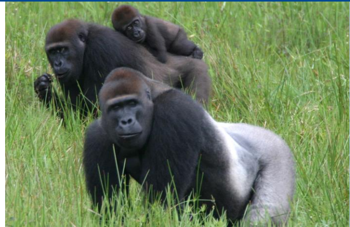
REPUBLIC OF CONGO – 2004: Western lowland gorilla in Mbeli Bai, Nouabalé-Ndoki National Park.

In addition to harboring an array of globally important wildlife, Sangha Tri-National's vast forests are important carbon sinks, acting as a critical buffer against climate change.