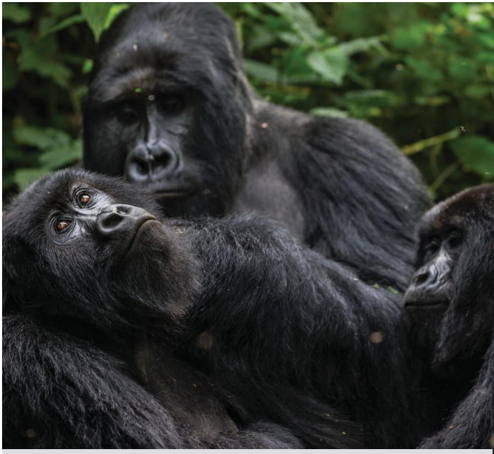
REPUBLIC OF CONGO – 2004: Endangered western lowland gorillas in Mbeli Bai, Nouabalé-Ndoki National Park enjoy better protection due to USAID's conservation efforts.