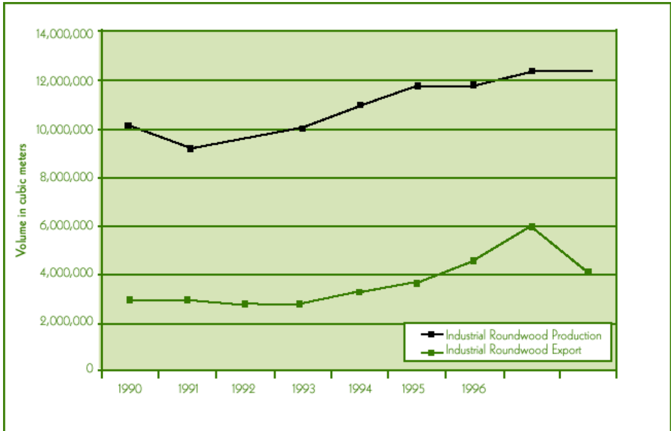
Figure 2: Congo Basin countries included: Gabon, Equatorial Guinea, Central African Republic, Sao Tome y Principe, Republic of Congo, Democratic Republic of Congo.