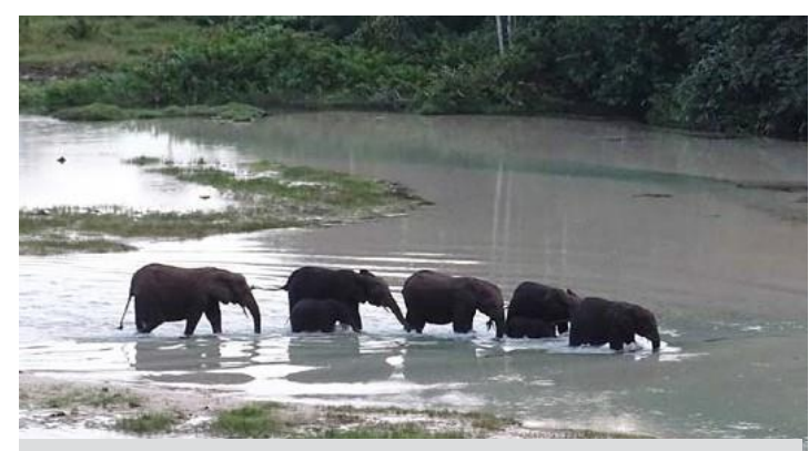
REPUBLIC OF CONGO – 2015: CARPE's support has been instrumental in preserving a remnant population of forest elephants.

Batéké-Leconi-Léfini has an unusual potential for sustainable development due to its relative proximity to Brazzaville (about 100 kilometers south), its well- organized communities and its open habitat, which means that it is possible to develop several economically viable activities, including the generation of carbon credits, commercial livestock production, agroforestry and tourism, resulting in a healthy balance of community and commercial interests and conservation priorities.