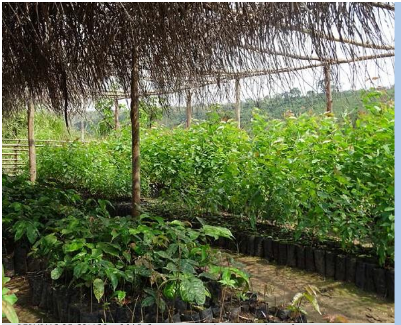
REPUBLIC OF CONGO - 2015: Community members are producing fast growing tree species in the Mpama tree nursery on the Batéké Plateau.