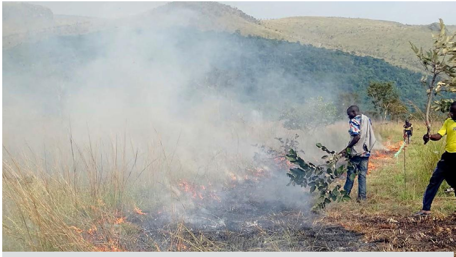
REPUBLIC OF CONGO - 2015: Controlled, early burning in an experimental fire management plot established in the Léfini Faunal Reserve.