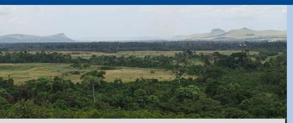
REPUBLIC OF CONGO - 2015: A view of the Lefini Valley.