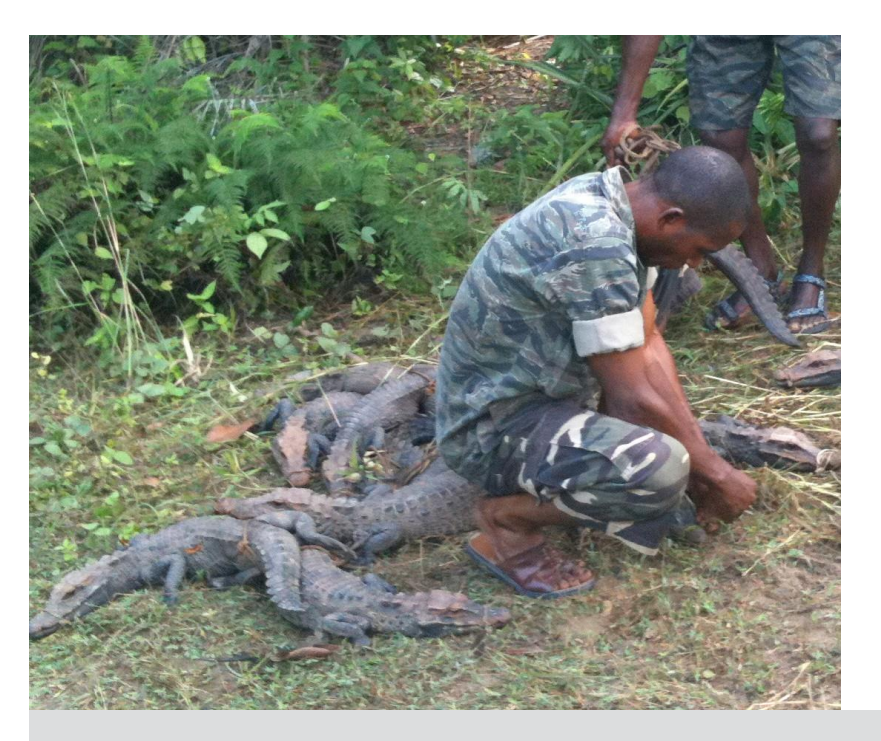
REPUBLIC OF CONGO – 2009: Eco-guards release confiscated crocodiles in Lac Télé.