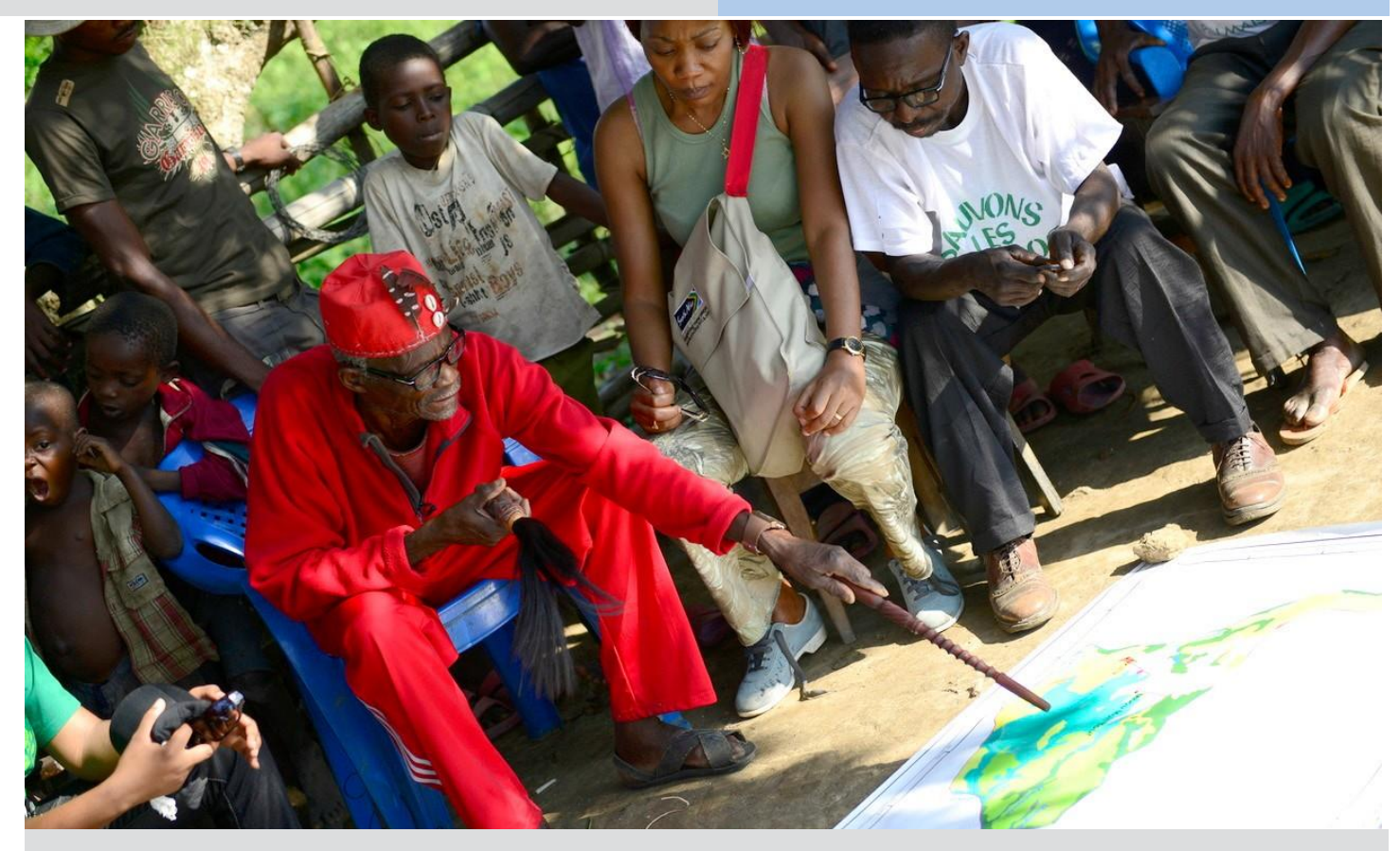
\textit{MALEBO, LAC TUMBA} - 2015: \textit{Traditional Chief at land use planning meeting in Mbou Mon Tour Village}. \ \textit{Photo by Jordan Kimball for USAID}