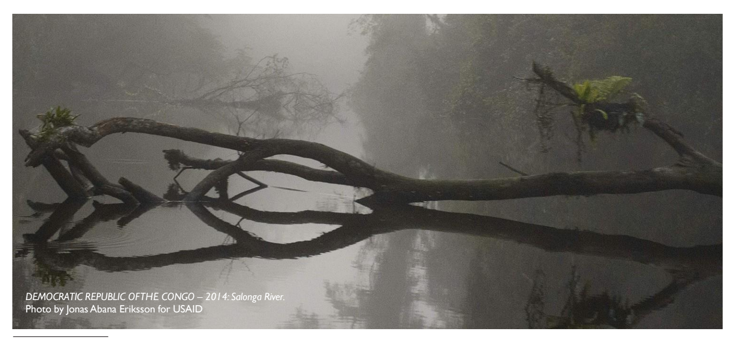
I Spatial Monitoring and Reporting Tool