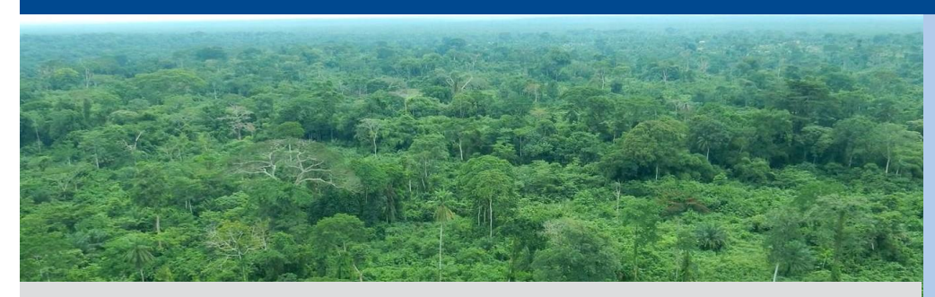
DEMOCRATIC REPUBLIC OFTHE CONGO -2015: Aerial view of the Salonga landscape.