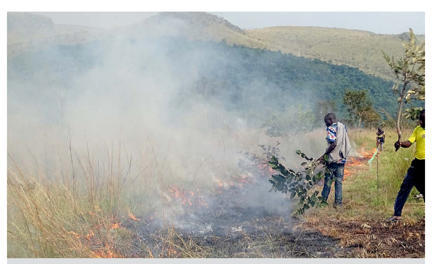
REPUBLIC OF CONGO – 2015: Controlled, early burning in an experimental fire management plot established in the Léfini Faunal Reserve.