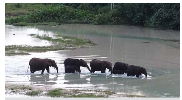
REPUBLIC OF CONGO – 2015: CAPRE's ongoing support has been instrumental in preserving a remnant population of forest elephants.

Batéké-Leconi-Léfini has an unusual potential for sustainable development due to its relative proximity to Brazzaville (about 100 kilometers south), its well-organized communities and its open habitat, which means that it might be possible to develop several economically viable activities, including the generation of carbon credits, commercial livestock production, agroforestry and tourism, resulting in a healthy balance of community and commercial interests and conservation priorities.