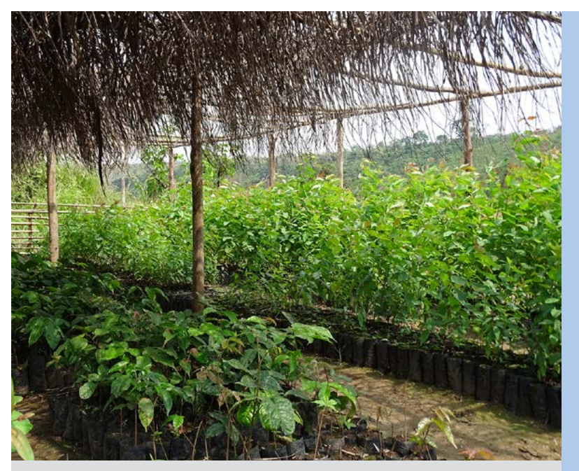
REPUBLIC OF CONGO – 2015: Community members are producing fast growing tree species in the Mpama tree nursery on the Batéké Plateau.