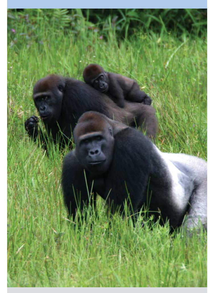
REPUBLIC OF CONGO – 2004: Endangered western lowland gorillas in Mbeli Bai, Nouabalé-Ndoki National Park enjoy better protection due to USAID's conservation efforts.

For more information: www.carpe.umd.edu CARPEManagement@usaid.gov