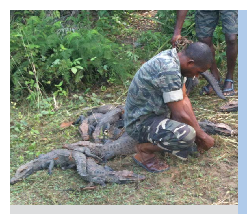
REPUBLIC OF CONGO – 2009: Eco-guards release confiscated crocodiles in Lac Télé.