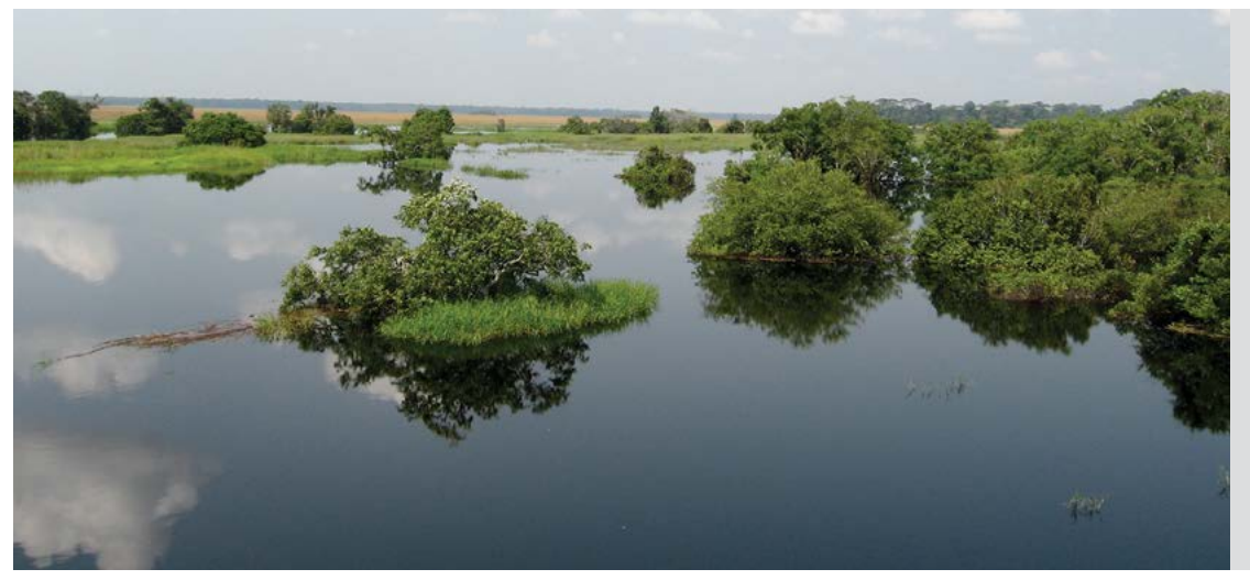
REPUBLIC OF CONGO – 2006: The slow-flowing Likouala-aux-Herbes River ('Grassy Likouala River') is the main artery of the Lac Télé swamps. The river rises and the swamp floods several months after the rains; subsurface seeps and flows from neighboring rivers flowing from the Central African savannas to the north fill the swamps around Lac Télé.

long section of rich forest running parallel to the south bank of the Congo in the DRC section of the landscape, which is one of DRC's key REDD+ pilot areas.