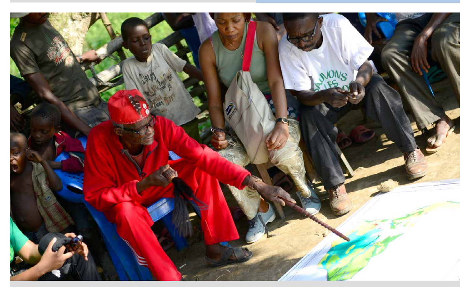
MALEBO, LAC TUMBA - 2015:Traditional Chief at land use planning meeting in Mbou MonTour Village.