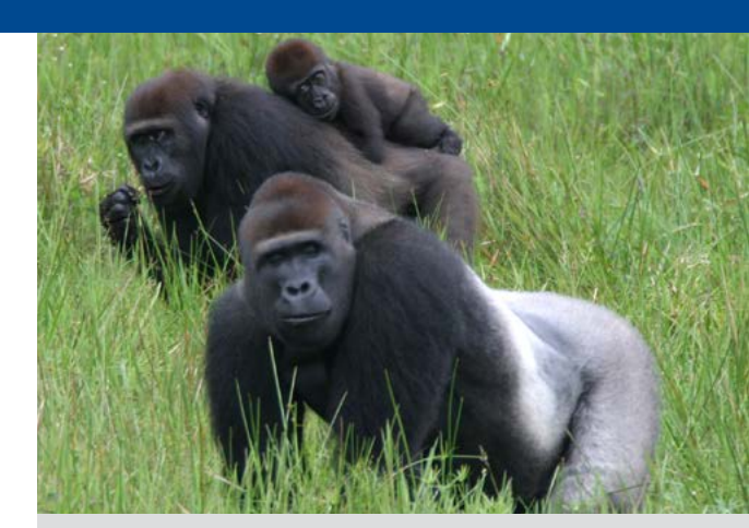
REPUBLIC OF CONGO – 2004: Western lowland gorilla in Mbeli Bai, Nouabalé-Ndoki National Park.

In addition to harboring an array of globally important wildlife, Sangha Tri-National's vast forests are also important carbon sinks, acting as a critical buffer against climate change.