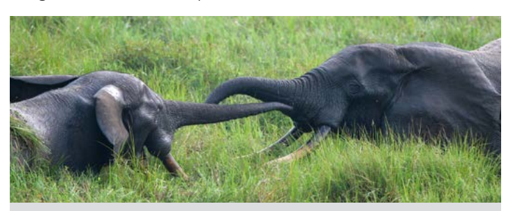
REPUBLIC OF CONGO – 2015: USAID is supporting more effective patrolling against illegal poaching activity in Nouabalé-Ndoki National Park, resulting in better protection for the park's important forest elephant populations.

As the transportation system continues to develop, future logging and mining operations, along with commercial agriculture, could also pose additional threats as more of Sangha Tri-National is opened to commercial ventures.