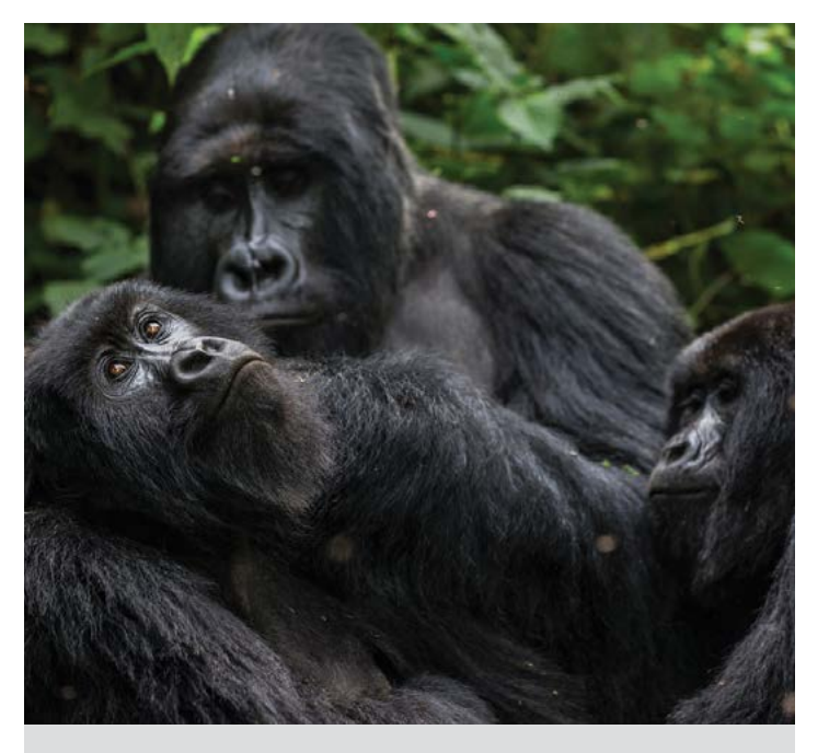
REPUBLIC OF CONGO – 2004: Endangered western lowland gorillas in Mbeli Bai, Nouabalé-Ndoki National Park enjoy better protection due to USAID's conservation efforts.