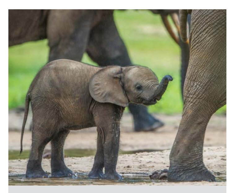
REPUBLIC OF CONGO – 2004: Forest elephant populations in the Sangha Tri-National Landscape are growing with the help of USAID's conservation efforts.