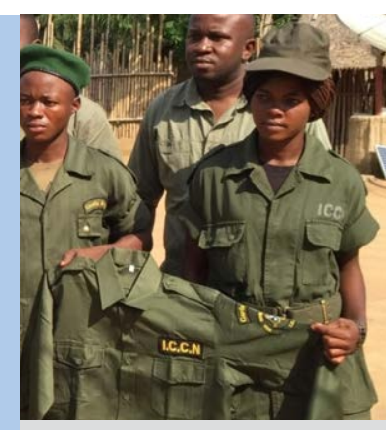
DEMOCRATIC REPUBLIC OF THE CONGO -2014: Eco-guards receive equipment in Maringa-Lopori-Wamba Landscape.