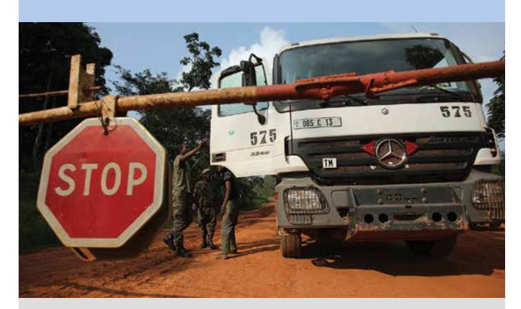
DEMOCRATIC REPUBLIC OF THE CONGO – 2012: Eco-guards check a logging truck in the Nouabalé-Ndoki National Park buffer zone.