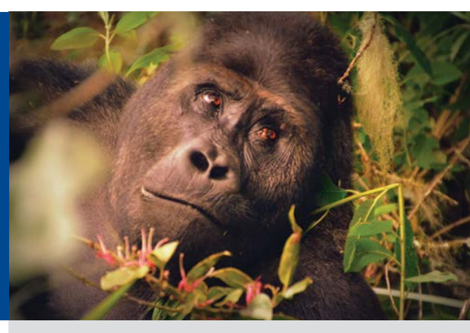
DEMOCRATIC REPUBLIC OF THE CONGO – 2015: USAID support for rangers in Kahuzi-Biega National Park helps protect populations of critically endangered Grauer's gorillas.